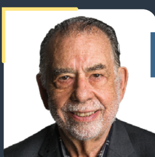
Francis Ford Coppola

Former Chairman and CEO, Hewlett-Packard Company